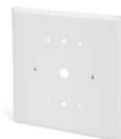
5000-012: Detector Cover Plate. Pre-drilled to mount the FIRE ® RAY 5000 Detector Head to a double gang electric box.