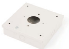
5000-011: 5000 Series Detector Uni-Box. Back box and hinged lid includes conduit knock-outs on all four sides. Universal back plate mounting with one conduit knock-out. Captive screw lock on front plate. Mounting holes for optional 1000-018 wire cage and 3000-202 flush mount plate.

For use with FIRE ® RAY 5000 3000 50R/100R 2000 EExd