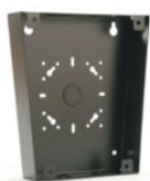
5000-009: Controller Back Box. For use with FIRE ® RAY 5000. Includes conduit knock-outs on top and bottom. Surface or Flush Mount. Universal back plate mounting with one conduit knock-out.