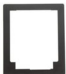
5000-010: Semi Flush Trim Plate. Mounts on the 5000-009 Controller Back Box for semi-flush installations.