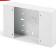
3000-209: Controller Back Box. For use with FIRE ® RAY 3000. Surface/semi-flush mount back box. Metal with knock-outs on top and bottom. Has a universal back plate mounting hole pattern.

For use with FIRE ® RAY 5000 3000 50R/100R 2000 EExd