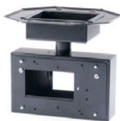
5000-014: Universal Ceiling Mount. For use with FIRE ® RAY 5000, 3000 and 50R/100R prism and Universal Bracket.

For use with FIRE ® RAY 5000 3000 50R/100R 2000 EExd