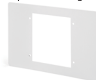
3000-210: Semi-Flush Trim Plate. For use with FIRE ® RAY 3000. Plate for use with 3000-209 Controller Back Box (sold separately). Use when 3000-209 back-box is recessed in wall for clean finish look.

For use with FIRE ® RAY 5000 3000 50R/100R 2000 EExd