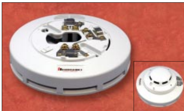
Shown with detector