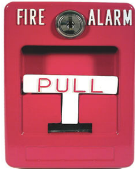
MODEL SP-1 (SINGLE POLE) MODEL SP-2 (DOUBLE POLE)