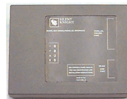
5824 Serial/Parallel Gateway Module