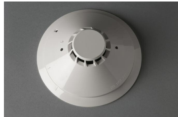
Model HFS-P and HFS-PT

Single Gang Box; Minimum Depth – 1½" (38 mm)